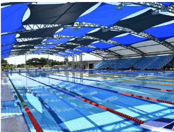
Tobruk Memorial Pool Cairns