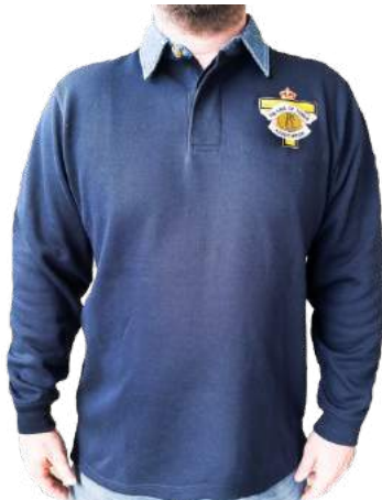
ROTA RUGBY TOP Sizes S, M, L, XL, XXL XXXL, XXXXL, XXXXXL $60