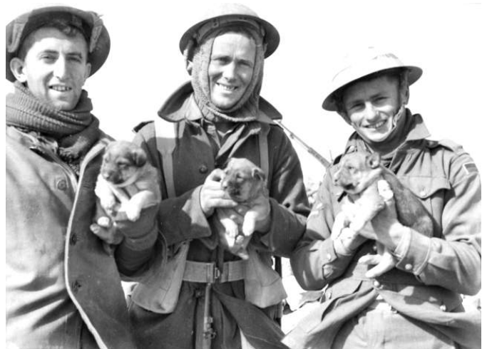
A dog adopted as a mascot by an Australian infantry unit in Tobruk.