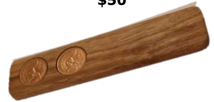
TWO-UP SET Includes kip and two 1941 pennies $17