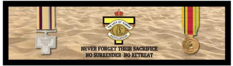
SIEGE OF TOBRUK BAR MAT $40