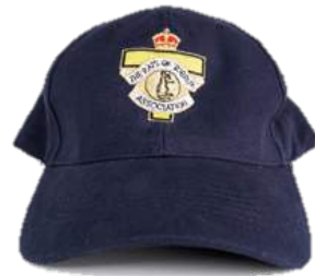
ROTA 'BASEBALL' CAP One size fits all $20