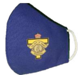
ROTA FACEMASK Small or large Special offer $7