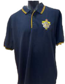
ROTA POLO SHIRT Sizes S, M, L, XL, XXL XXXL, XXXXL, XXXXXL $50