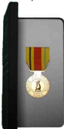
80 TH ANNIVERSARY SIEGE MEDAL (Limited Stock remaining) $50