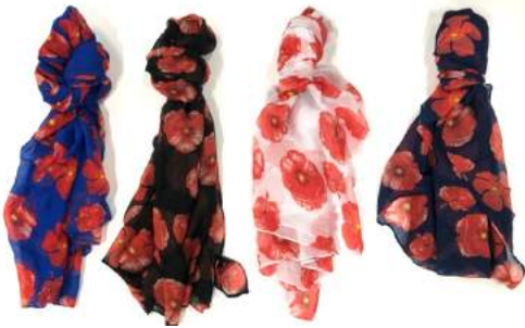
LADIES SUMMER POPPY SCARF Light Blue, Dark Blue, White, Grey, Black $15

See Order Form on page 19 for postage costs and other details.