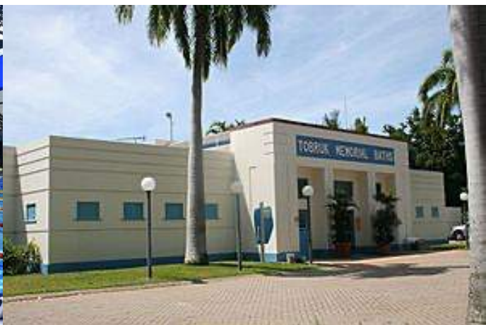
Townsville- Tobruk Memorial Baths

It would be gratifying to think that people driving down these streets or using these facilities might stop and think about the history behind these names. Let's hope so.