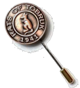
RATS OF TOBRUK 1941 LAPEL BADGE $15