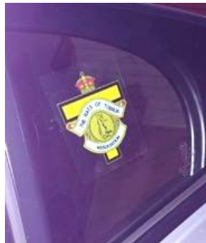
ROTA BADGE CAR WINDOW STICKER 7cm x 8.5cm approx Sticks to inside of window $10